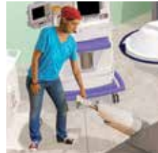
Thorough cleaning for enhanced infection prevention