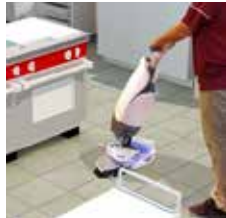
HAACP color coded accessories help prevent cross contamination