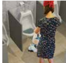
Deep-scrubs grout and gets under fixtures and equipment